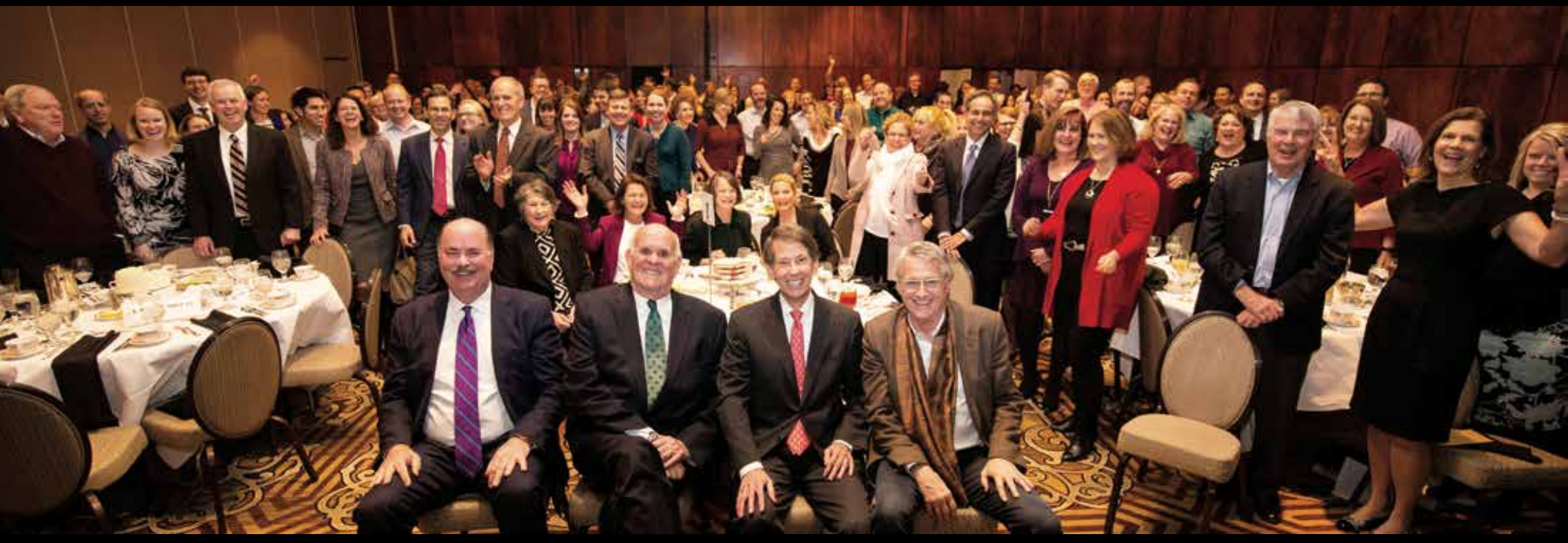
WTO 20th Anniversary Celebration – February 1, 2018